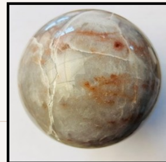
CRYSTAL PEAK AGATE

Call or text: 801-390-8270 or 385-319-2808